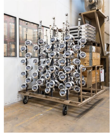
Bang&Olufsen Factory Tour