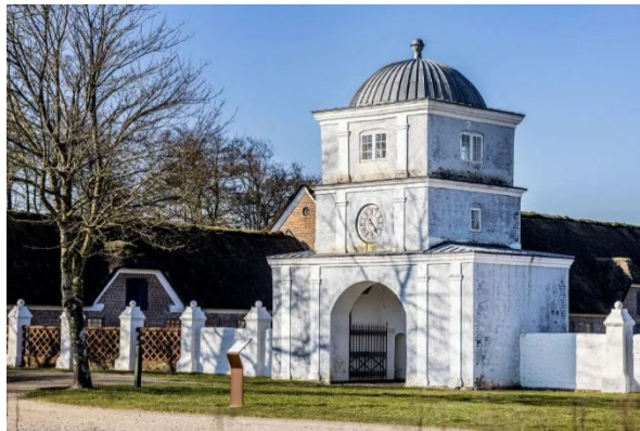
Hotel Nørre Vosborg

Hotel room rates are $112 USD (795 DKK) for a double room and $140 (995 DKK) for a superior room. IHAA will make the room reservations, but attendees will be responsible for payment.